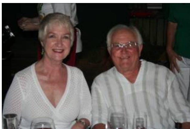
And some of the delightful company